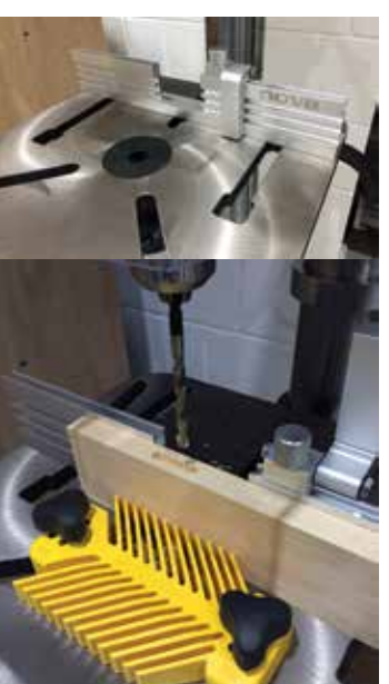
The nicely made fence does a job but could be better

The removable table insert does allow for use of sanding drums but only up to 50mm diameter. Personally I do not trust the chuck – fitted with MT2 taper – not to come loose