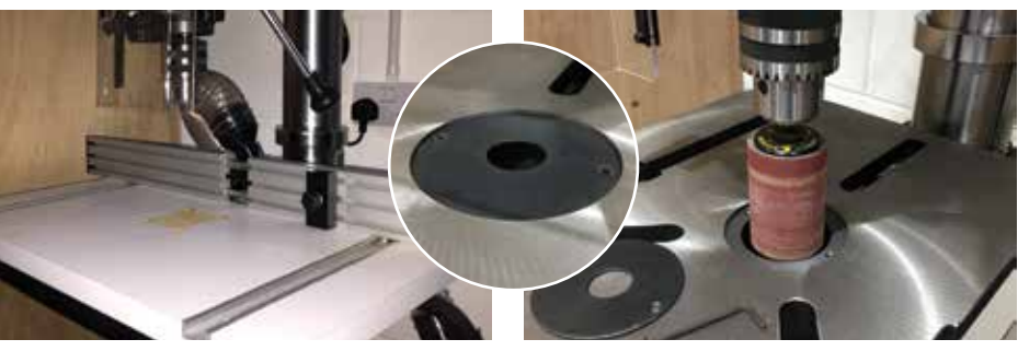
LEFT: A false table such as this can be easily made or bought for around a little more than the Nova fence INSET: The low insert plate is annoying when drilling at the end of a workpiece] RIGHT: Quill lock allows height setting on a sanding drum - maximum size 50mm

as any sanding drum will create vibration and it would then drop straight through. An unusual feature of the drill is a quill lock so at any feed depth you can lock and it will stay that depth. When sanding you can then use different parts of the drum without the hassle of moving the table up/down. What I would do is make a box to sit on the table, deep enough to accommodate the full length of a drum and with extraction. If the drum/ chuck combination falls out it drops into the box and if I create different diameter inserts I should be able to use my bigger drums and be relatively dust free.