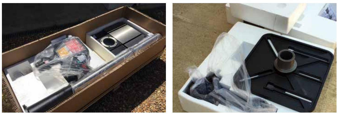
A single pallet contains the kit of parts...