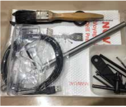
The eagle eyed may spot I have already removed the spring-loaded pin from the 'safety' chuck key, really annoying